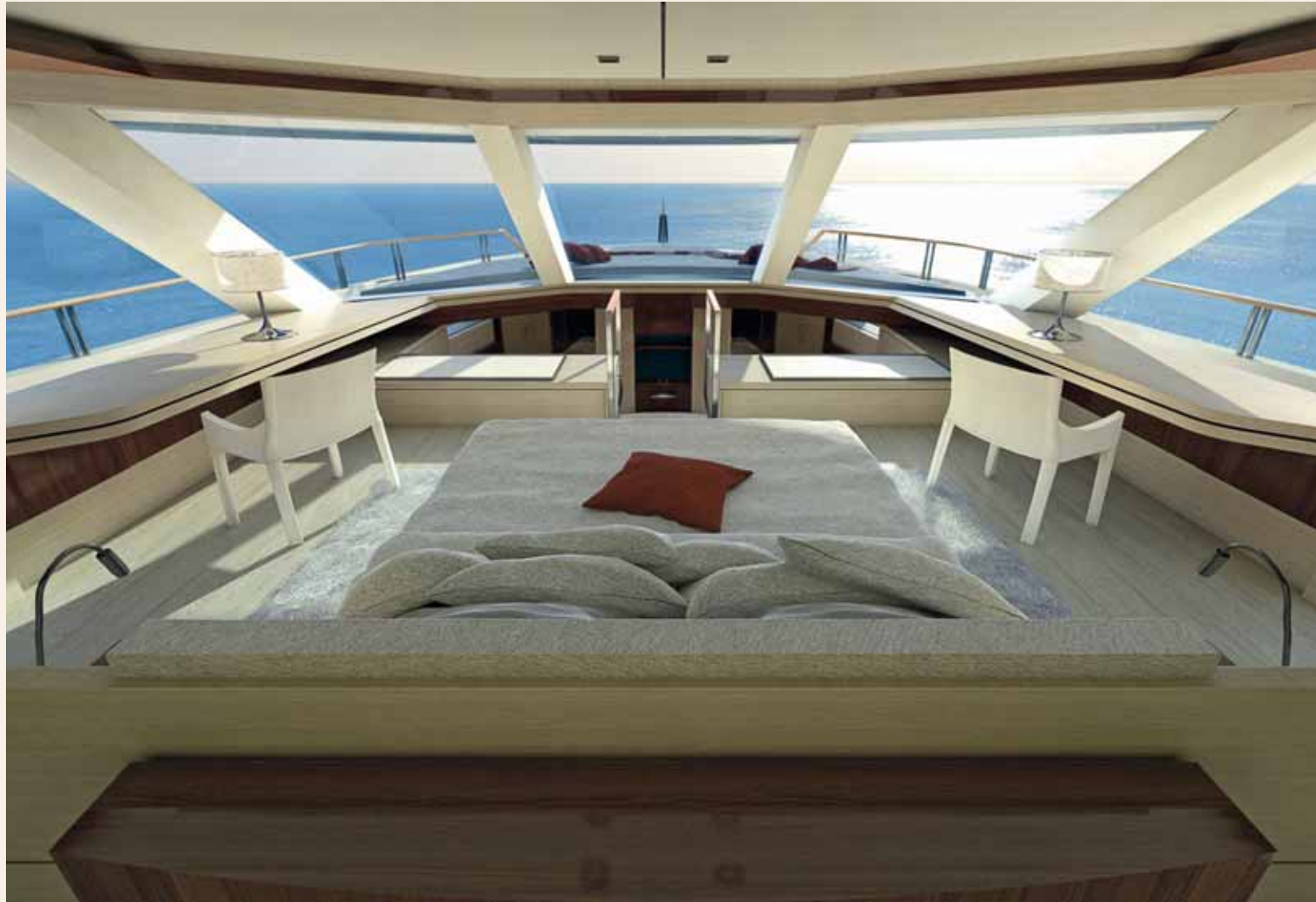
▲▼ The Owner's cabin