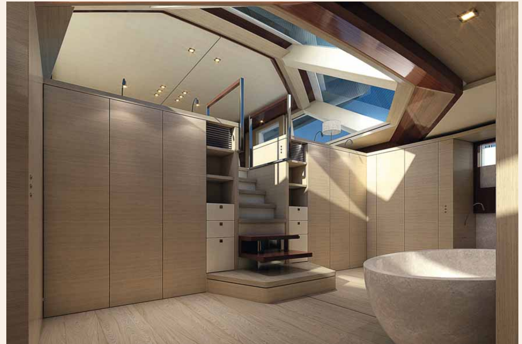
▲▼ The Owner's cabin