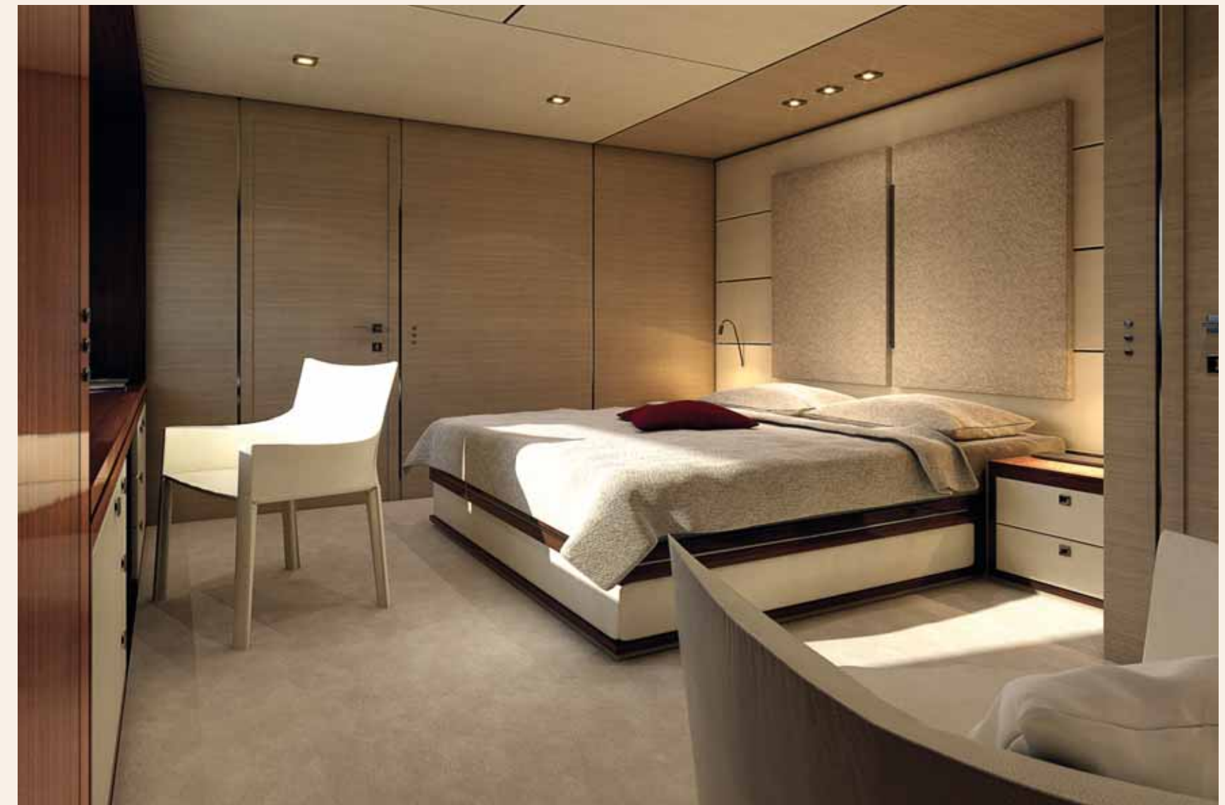
▲▼ The VIP cabin