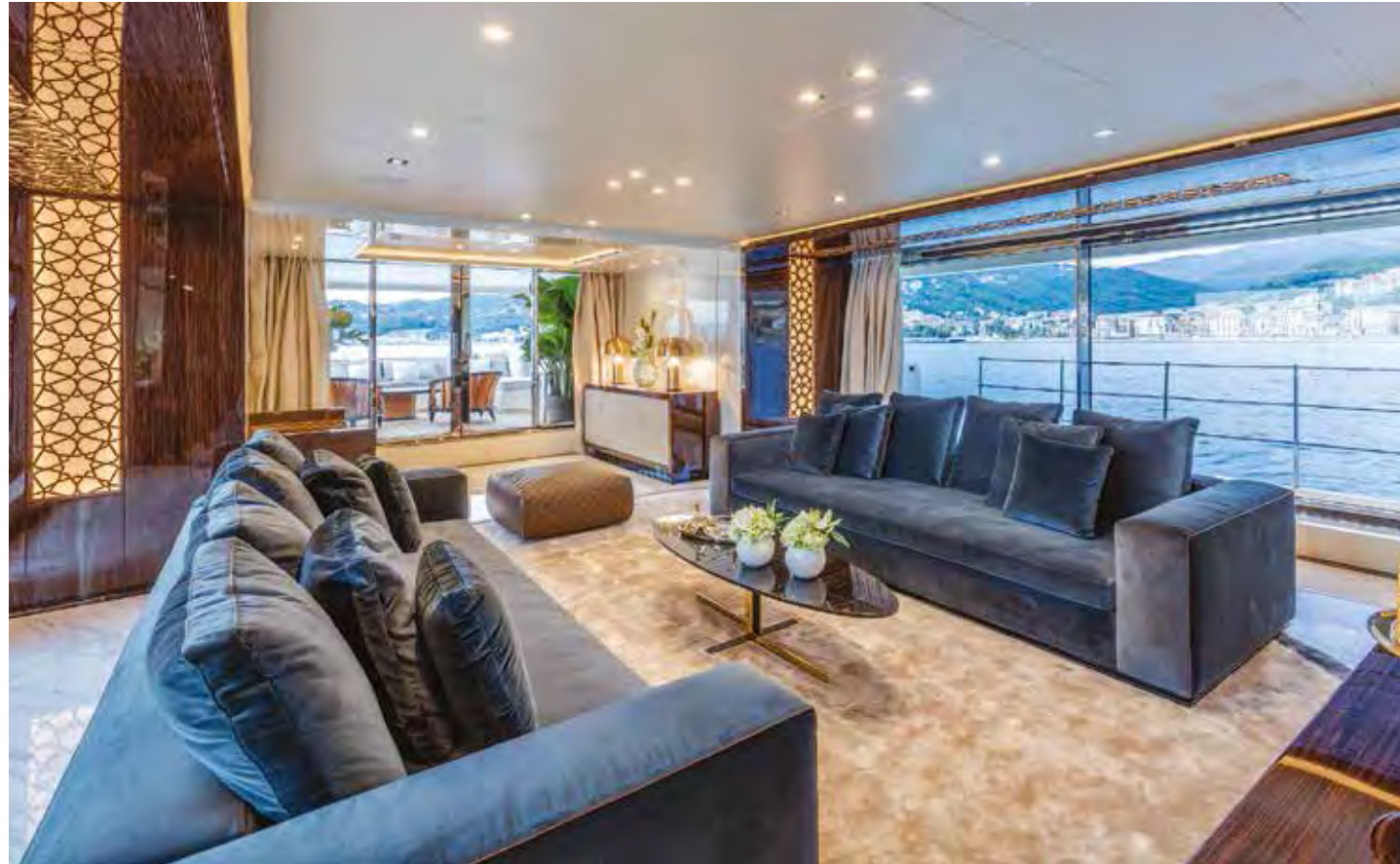
Above: Full-height windows in the main salon, as well as fold-down balconies on either side, turn this space into “a floating terrace.” Below: Bright-green vertical gardens over the beds in the guest cabins are part of Serenity’s distinctive décor.