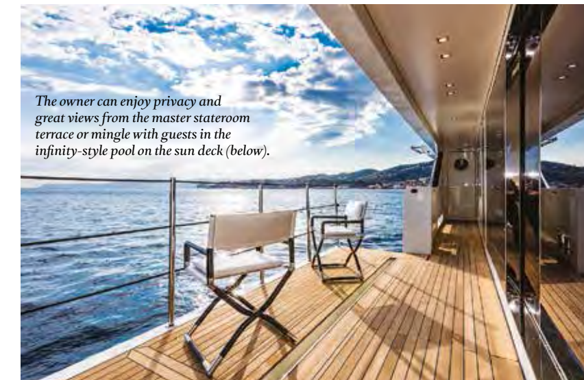
The owner can enjoy privacy and great views from the master stateroom terrace or mingle with guests in the infinity-style pool on the sun deck (below).

There’s more to come in the SF line, which starts with an SF30 and goes up to an SF60. As Mondomarine builds upon its 100-year history, it marches on with new ownership, a recently opened Monaco office and ambition to grow in markets far beyond its historic home. Serenity is a good addition, sure to garner attention in the Middle East and beyond. ■