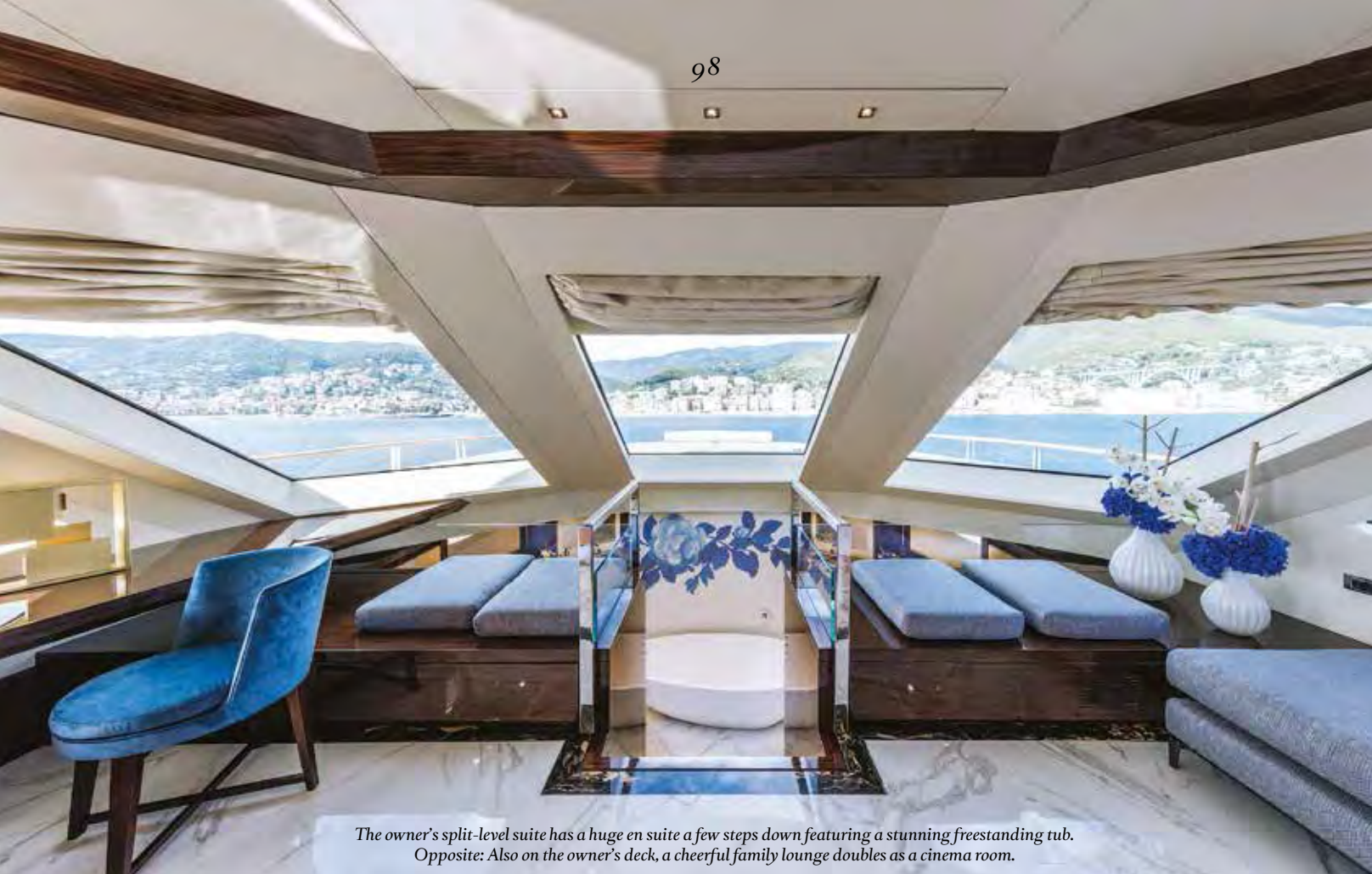
The owner's split-level suite has a huge en suite a few steps down featuring a stunning freestanding tub. Opposite: Also on the owner's deck, a cheerful family lounge doubles as a cinema room.

S erenity may project calm and composure, but she certainly isn't idle. After her debut at the Monaco Yacht Show in September 2015, this unconventional yacht built at Mondomarine returned to the yard in Savona, Italy, to prepare for a 4,500-mile trip across the Mediterranean Sea, down the Suez Canal and to Dubai via Oman. And then, after the Dubai International Boat Show in March, she headed for a cruise in the Oman fjords.